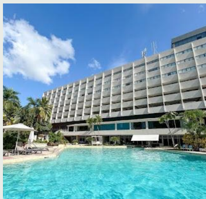
DOMINICAN FIESTA HOTEL